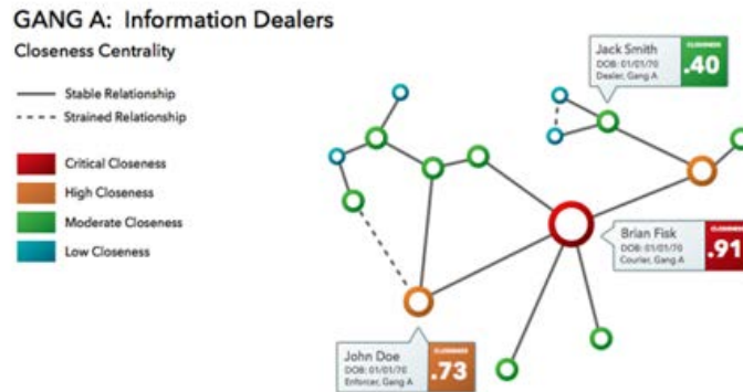
Figure B: Hypothetical Social Network Analysis 76

When used by a police department, social network analysis might be used to identify a “central node”: a person with a high degree of “connectivity within the network” (Figure B). 77 While traditional police work might easily identify leaders within a criminal organization, social network analysis can identify those with influence or those who transmit information within the group quickly and yet whose roles are not otherwise apparent. 78 The software can even reveal deliberately concealed affiliations. Even if an individual suspected of being part of a criminal organization does not admit his affiliation, social network software can calculate the probability of his membership. 79